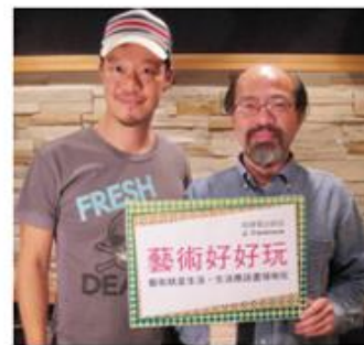
Guest: Wei-Jan Chi / Playwright