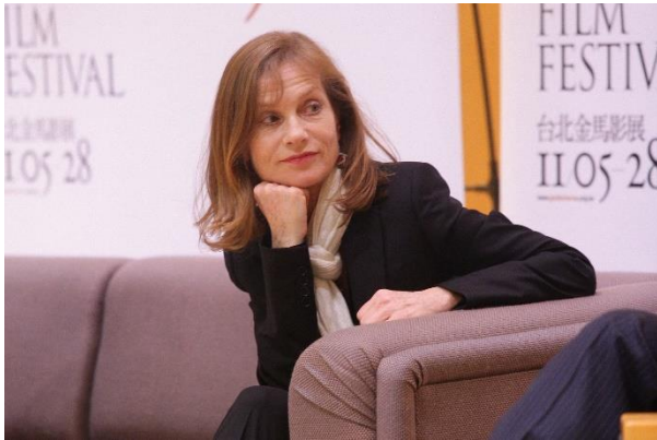
Isabelle Anne Madeleine Huppert